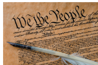
A Promise Made is a Promise Kept.

If you answered yes to all or most of these questions, then you should support an Article V convention, mainly because these six amendments illustrate what Congress has never proposed and likely will never propose.